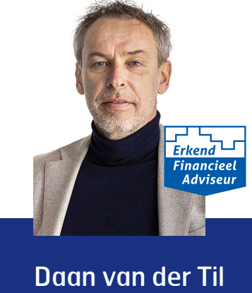
Your financial advisor

Sunday: Closed Appointments possible outside of opening hours